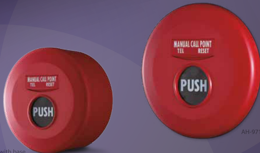
AH-9717 with base